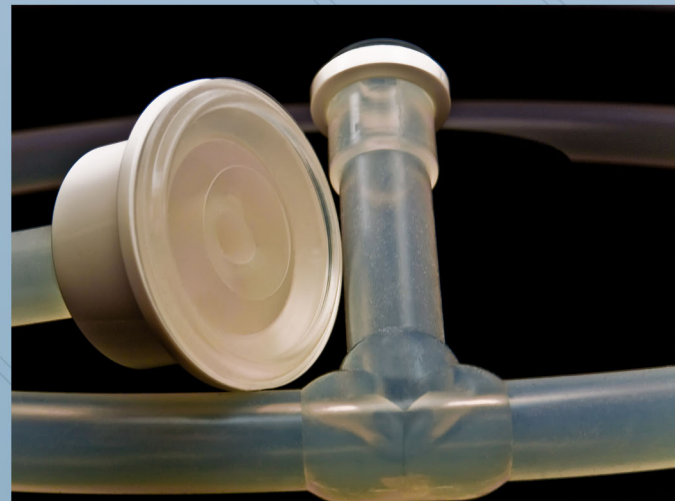
Molded Silicone TC Fittings