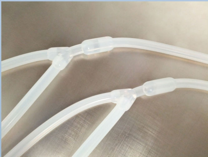
Molded Silicone Y Manifolds

Service-Focused: Kits can be multi-bagged, custom labeled and gamma sterilized, per end user requirements.