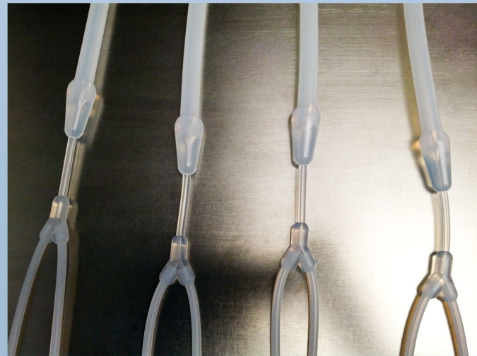
Tapered Transitions preserve delicate Product